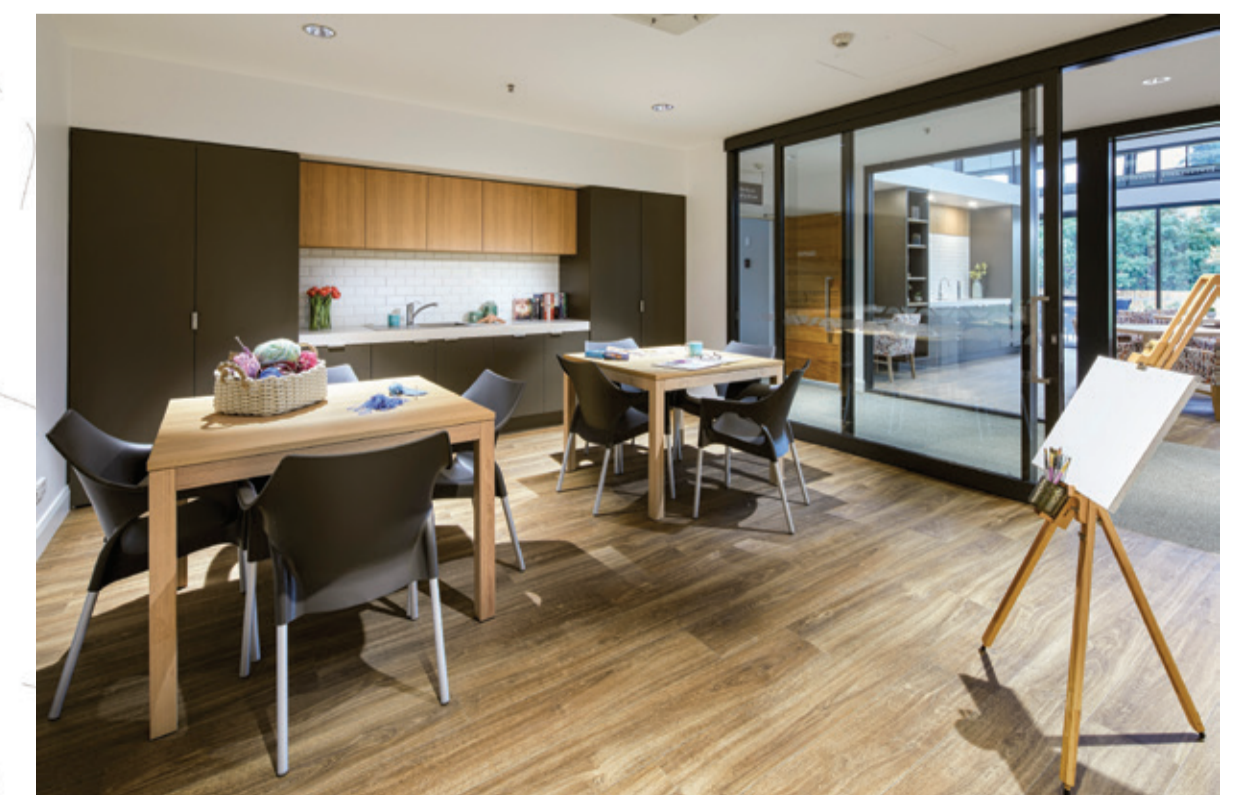
Resident common areas and hair salon, images are indicative