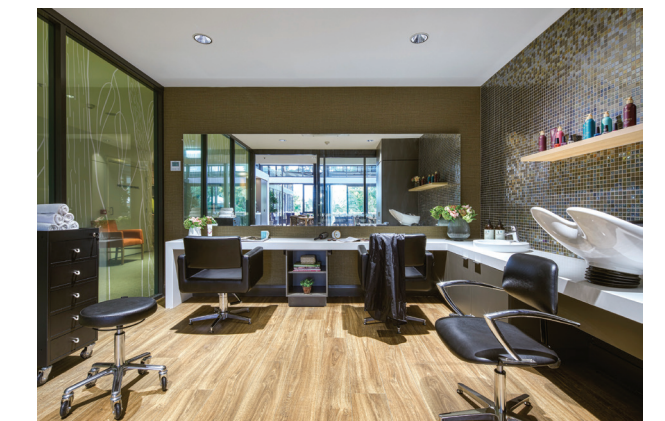
Resident common areas and hair salon, images are indicative