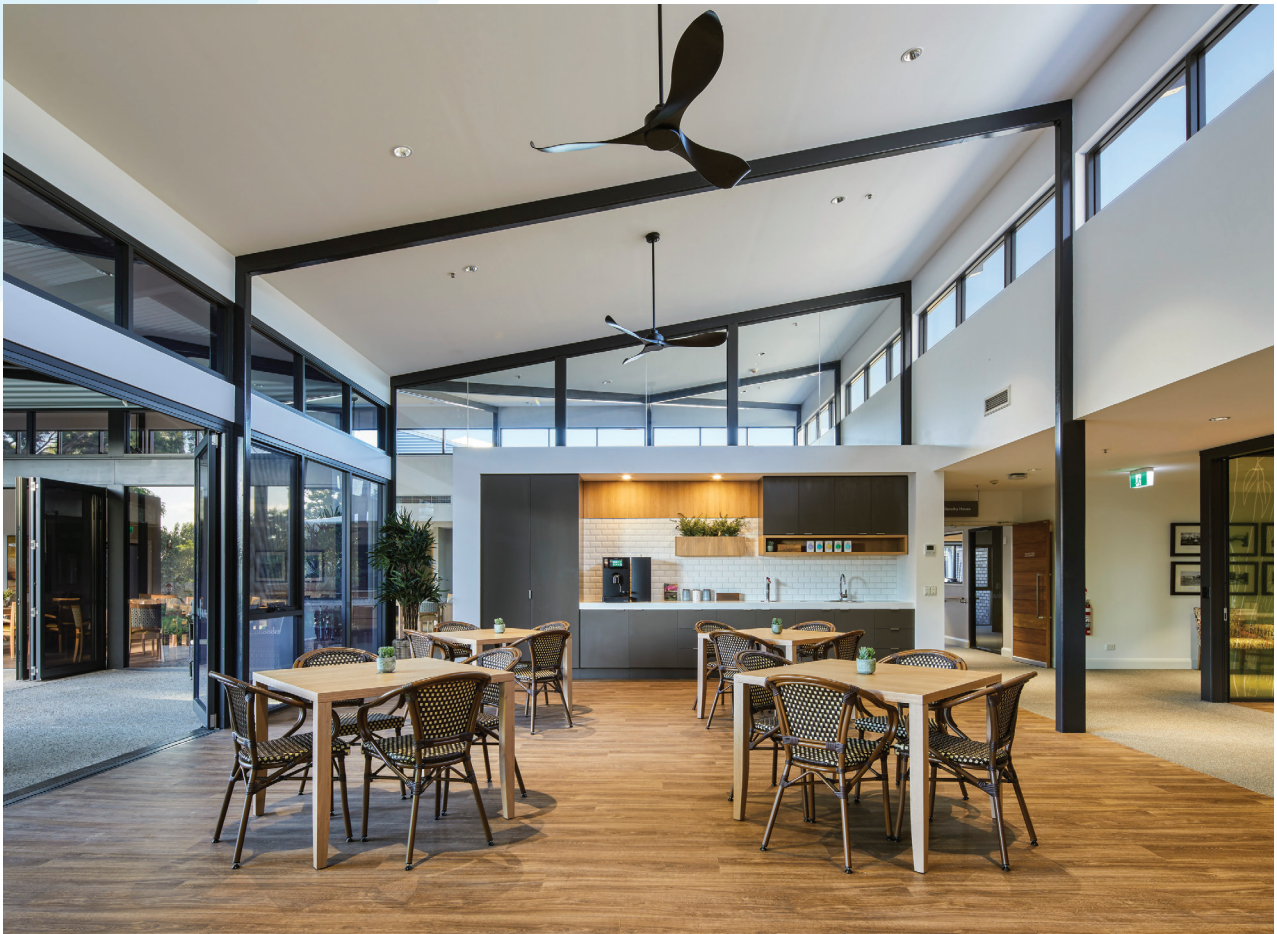
Dining area is open and spacious with connection to the outdoors. Image is indicative of the new aged care home.