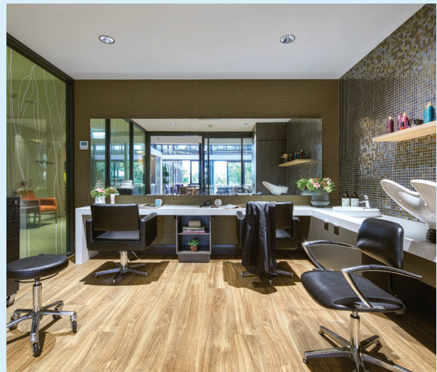
Common areas and hair salon. Images are indicative.